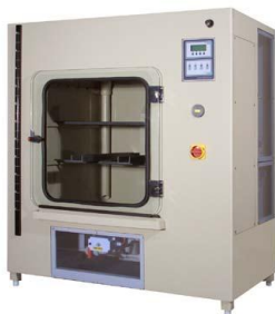
Vertical and Horizontal Salt spray chambers, 8 Models Full range of options for continuous and cycling test.