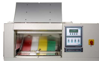
Solarbox Table top xenon testers 4 Models

We reserve the right to make changes to equipment and systems in response to advances in technology and modify parameter values accordingly.