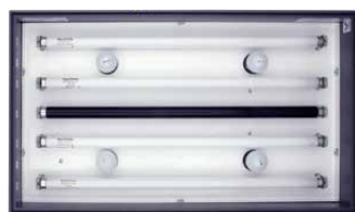
CAC60 lamp deck