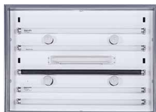
CAC LED 60-5 lamp deck