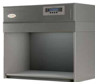
CAC60 Cabinet fitted with Diffuser

Benches are also available, allowing you to position your cabinet at the optimal observation height when used in conjunction with a VeriVide cabinet. Benches with plan drawers can also be supplied. (Further details on our Accessories Datasheet).